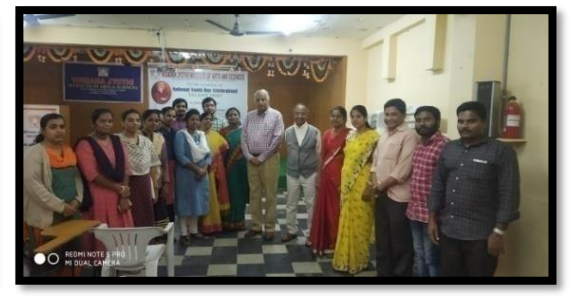
Interaction with Students during his Visit