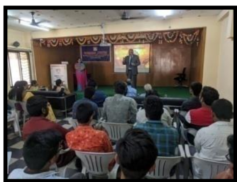
A talk on "Happiness and Success"