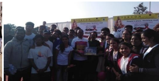
Our students at the 5K Run

On Sunday, 9 Feb 2020, our B. Com General first year students arranged lunch for 40 students at Oral School for the Deaf (Orphan School ) at East Marredpally.