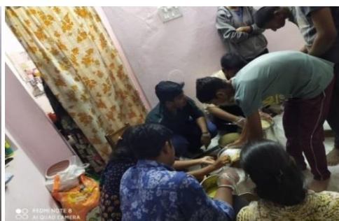
Our NSS Volunteers at the Orphanage Serving Food