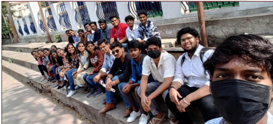
NSS Volunteers at Gandhi Hospital