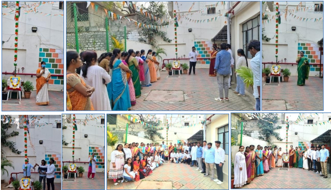
Republic day celebrations