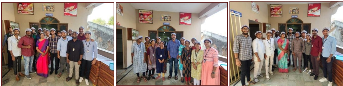
Final year students at Parle Industries