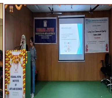
Technical Sessions in Progress