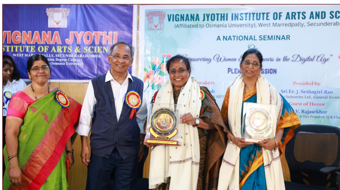
Felicitation of Keynote Speakers for the Plenary session