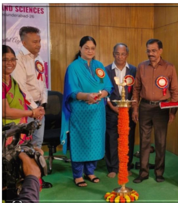
Lighting the Lamp by dignitaries