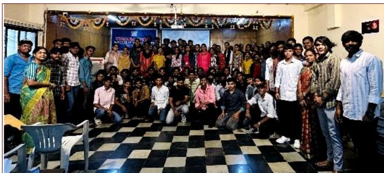
Participants of the Python Certification Course