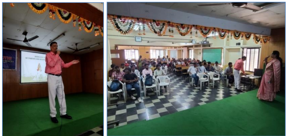
Guest Lecture on Research Methodology