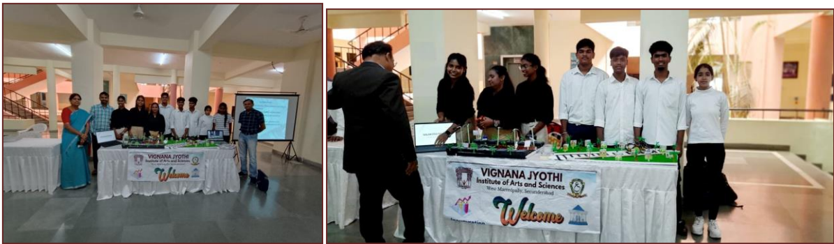
Project Presentations at Symposium

A Symposium on 'Creative Minds, Innovative Ideas, Sustainable Solutions Shaping the Future' was organized by ni-msme & Association of Business Women in Commerce & Industry on 21 April 2024. Two teams from our college, one from BBA III year and one from B.Com II year showcased their innovative projects on Solar Paneled Pathways and Obstacle Detector on Railway Tracks to Prevent Accidents, respectively. Our students' projects were greatly appreciated by visitors.