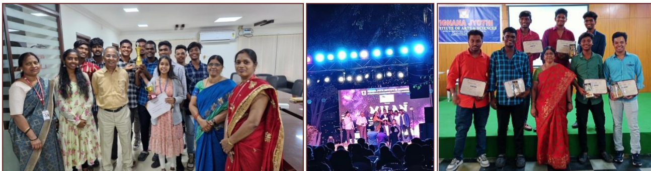
Management showing appreciation to the winners

VJIM conducted their annual event, an intercollegiate literary, sports & cultural competition, 'Milan '24' on 29 th Feb, 1 st & 2 nd March. On the third day, 'Chrysalis'- the cultural competitions, were held. Three teams from B.Com I & II year participated in the group dance category. Boys' team from the II year won the first prize for their performance on patriotism. One of the girl teams won the second prize for their Sambalpuri folk dance.