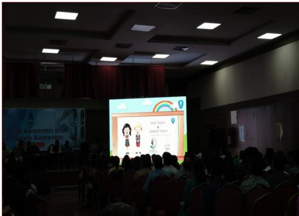
NSS meeting at Samskruthi Bhavan premises of Raj Bhavan, khairatabad