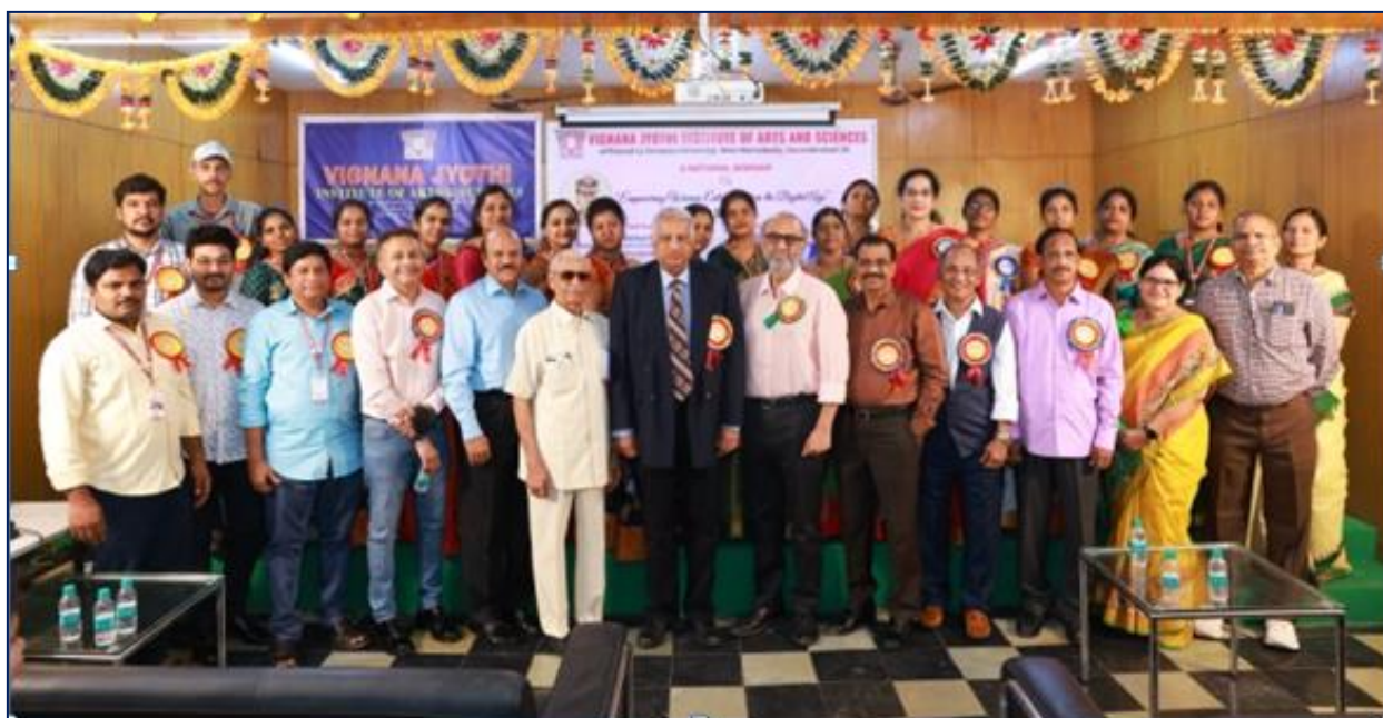
Faculty with all the members of the Management