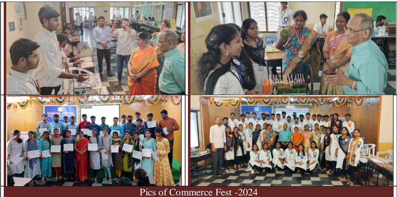
Pics of Commerce Fest -2024

Commerce Department organized a 'Commerce Fest' in college on 28 th March. 40 students from B.Com stream participated and presented models on many topics related to Commerce. For e.g., Digital Transformation of India, Cloud Computing, Start Up Finance, GST, IPR etc. 4 Teams conducted games related to team building. Certificates were provided to all the participants.