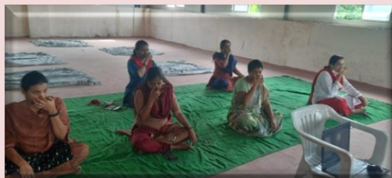
Pics on Yogaday