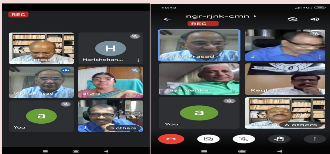
Officials at the Virtual meeting