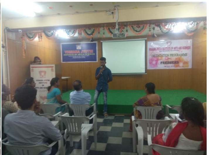
Freshers giving their opinion of the college