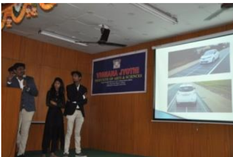
Students Presenting Innovations in Mobile Technology