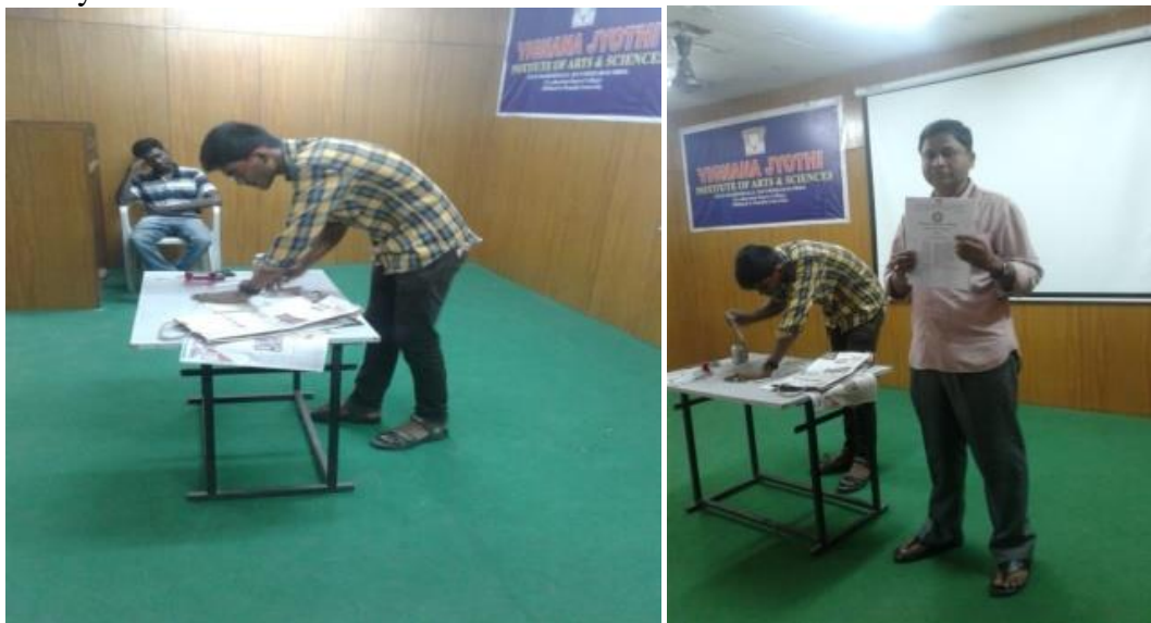
Preparation of Paper Bags