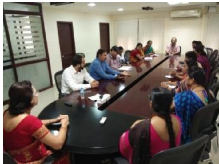
Orientation Program by TASK & BSNL officials on Certificate Courses