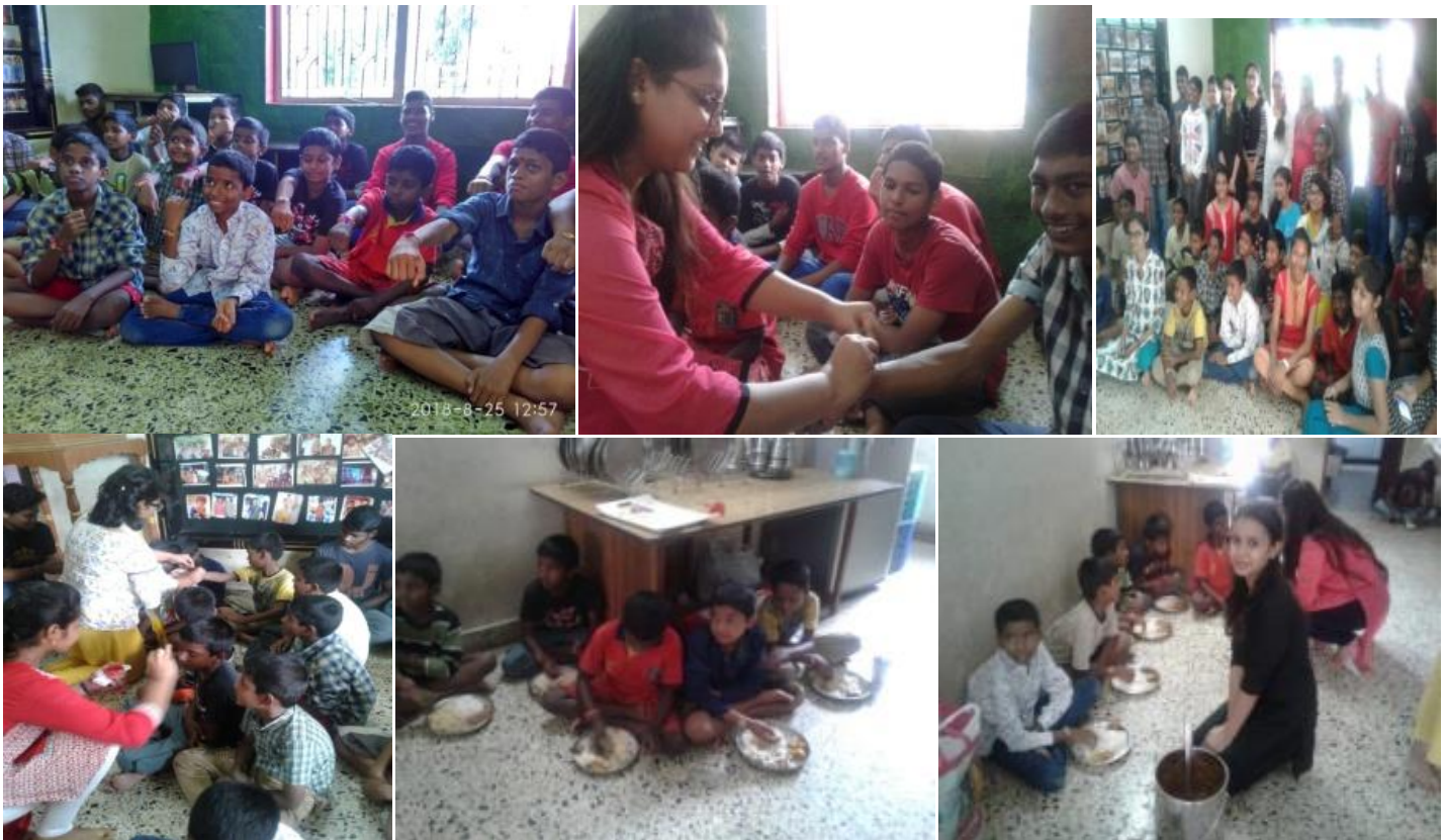
Students serving food and tying Rakhis to the inmates

All the girls of the NSS wing went to an orphanage “Manchikalalu” at West Marredpally and served food cooked by them to the inmates and tied Rakhis to the boys.