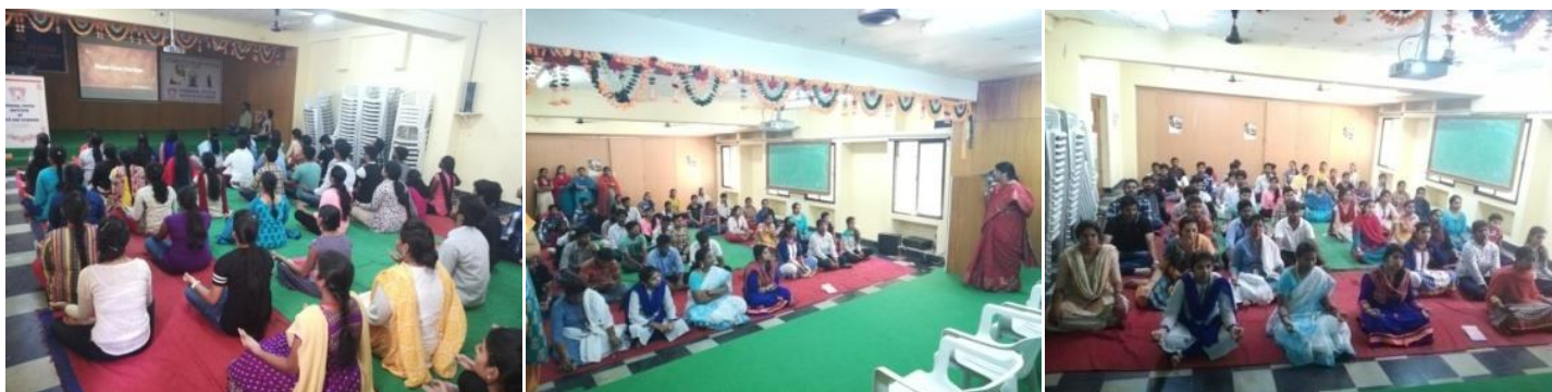
Yoga Day Celebrations

International Day of Yoga was celebrated in the college on 21-06-2018. Volunteers from Isha Foundation conducted a session on yoga and showed videos on Upa Yoga practices. Students and faculty participated in the program and did some simple yoga exercises.