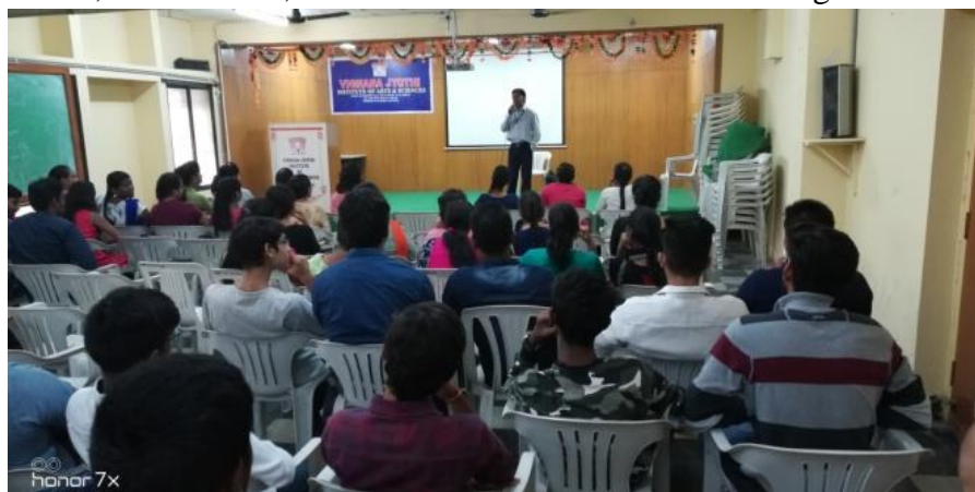
Financial Literacy Session in Progress