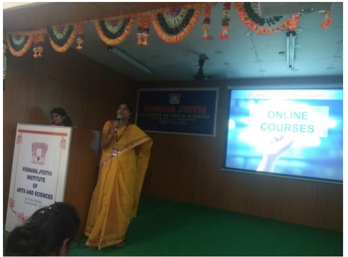
Presentation by various Committee members on Orientation day