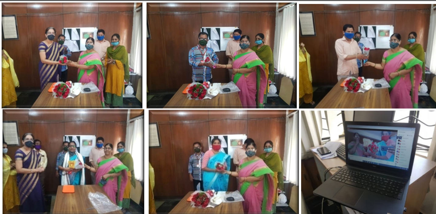
Teacher's Day Celebrations