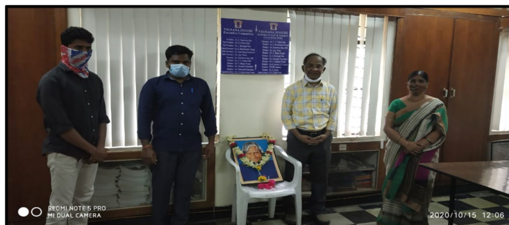
Dr. Abdul Kalam's Birthday