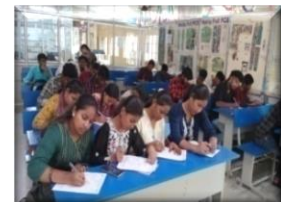
Our faculty & students at the workshop @ NSIC