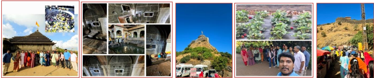
Places visited by faculty in Pune

During the trip to Pune, the delegation also visited some of the city's renowned temples, such as the Ganapati temple, Balaji temple, Bhimasankar temple which offered meaningful spiritual experiences. A visit to Tiger Point, from where the breathtaking panoramic view added a very unique and memorable element to the journey. Overall, the experience was very enriching and fulfilling.