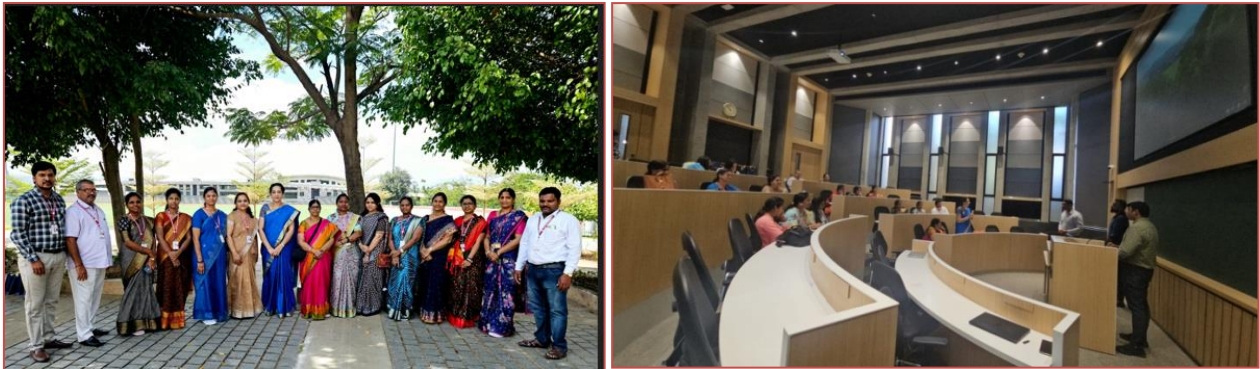
Faculty Group Picture at the Presentation

The experience proved to be an enriching opportunity for the participants to learn, adapt and implement innovative practices in their teaching and enhance educational excellence.