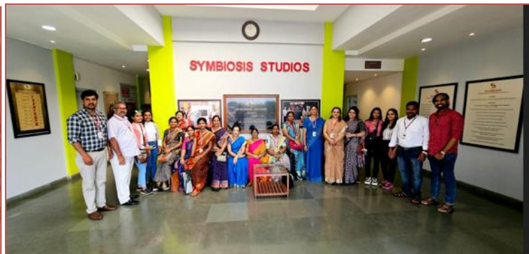
Our Faculty & Staff at Symbiosis University