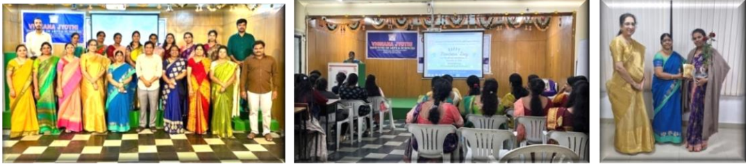
Teachers' Day Celebrations