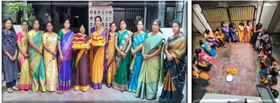
Bathukamma Celebrations @VJIAS