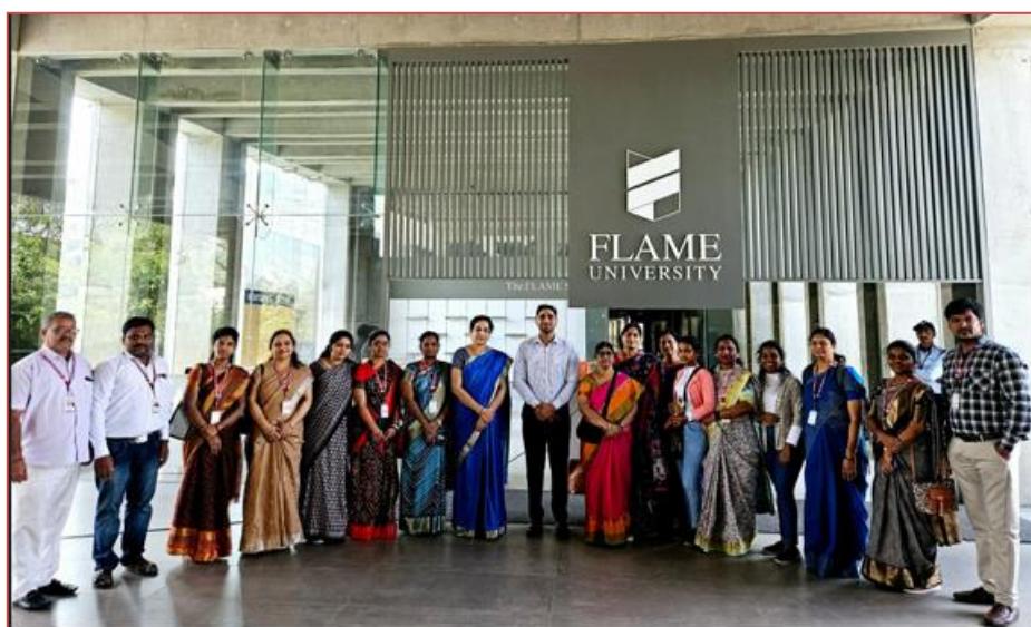
At FLAME University

VJ Management sponsored a 4 day educational trip to FLAME and Symbiosis International Universities, in Pune, Maharashtra, initiated & coordinated by the Deputy Director, and executed by the committee members, under the support of the Principal, from December 26 th to 30 th . The trip included the participation of both teaching and non-teaching staff of the college. The main objective of the expedition was to explore and get hands on experience of the innovative academic programs of both the Universities. At FLAME University, the focus was on understanding their liberal arts model, which emphasizes holistic development of the students and various other interdisciplinary approaches. They explained about the challenges in implementing different combination courses and how they handle such challenges in implementing such a flexible curriculum while maintaining academic rigor.