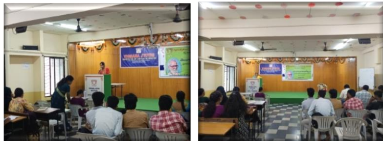
Telangana Bhasha Dinotsavam Celebrations