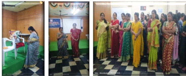
Dr. APJ Abdul Kalam's birth anniversary