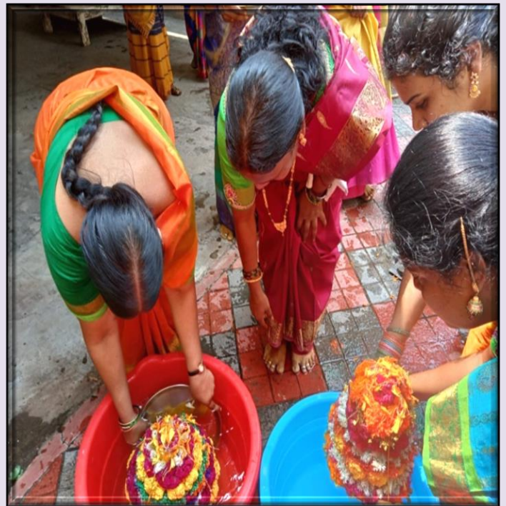
Preparation of Bathukammas