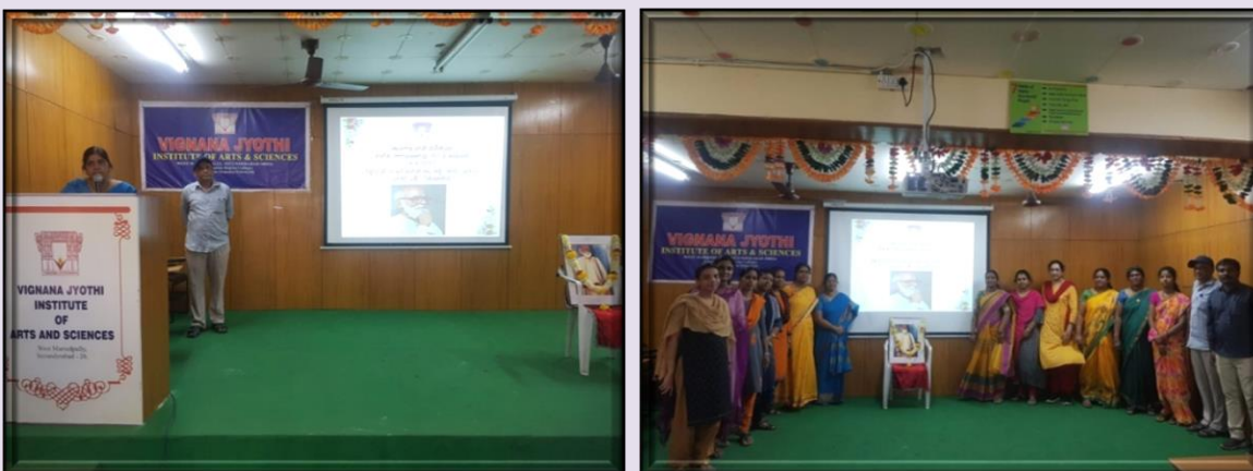
Principal's address on Telangana Bhasha Dinotsavam