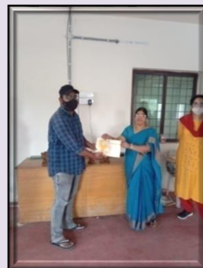
Distribution of Certificates to the winners of Ganesh Idol making Competition.